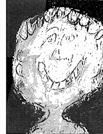
JEAN DUBUFFET French, 1901-1985

Smiling Face (La Bouche en croissant) , 1948 Oil and sand on canvas. 36 x 28 1/2 in. (91 x 72 cm)