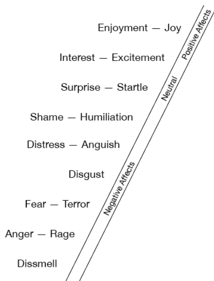
Figure 1. The Nine Affects (as presented in Wachtel & McClod, 2004).

Of particular interest is the affect of shame-humiliation as it is considered to be a critical regulator of human social behaviour (Nathanson, 1998). It defined by Tomkins (1987) as the experience triggered whenever a positive affect is impeded, thus an individual doesn't have to do anything wrong to experience shame. Nathanson (1998) extended Tomkin's script model and proposed that because shame is such a painful and self-focused affect (Parker, 1998) an individual needs to manage it though the use of coping styles or scripts. Nathanson (1992, p.132 -54) termed this model the Compass of Shame which describes four types of scripts, represented by the poles of the compass (see figure two), that individuals utilise to manage shame. Each script -Withdrawal, Attack Self, Avoidance and Attack Other - is associated with experiences of different behaviours, motivations and cognitions (Nathanson, 1992). A constructive way to manage shame is to attend to the source of impediment and to remove the stimulus, yet few achieve this ideal (Nathanson, 1992). Typically, an individual will respond to a shameful experience without attending to its source appropriately, thus responding via one or a mix of the four poles of the Compass of Shame that reduce, ignore or magnify the shame (Nathanson, 1992).